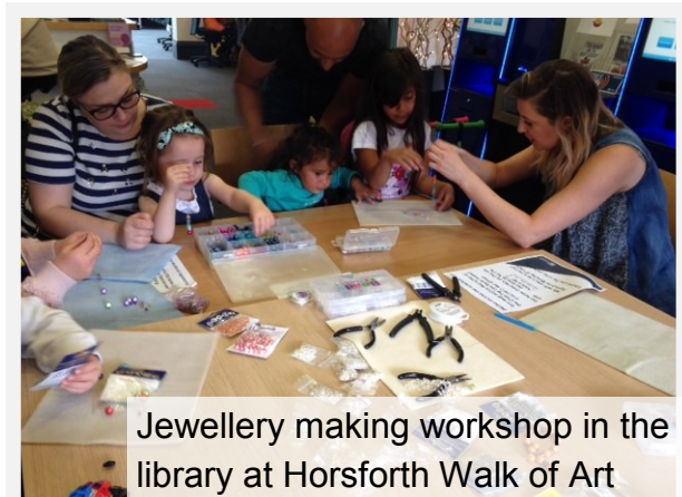
Jewellery making workshop in the library at Horsforth Walk of Art

Councillors continue to support the landmark Guiseley Clock Tower with £400 set aside to pay for the maintenance.