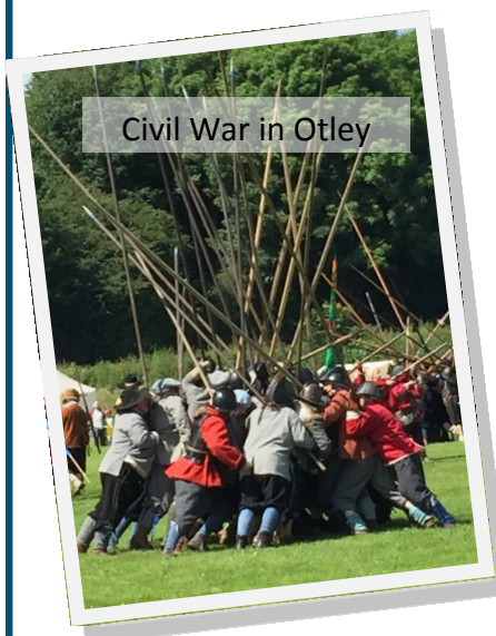
Civil War in Otley